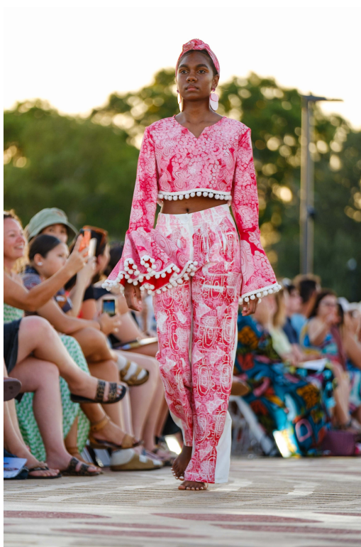
Nagula Jarndu Designs: empowering Aboriginal women through art and fashion

Did you know you can watch the Staircase to the Moon from Moonlight Bay Suites ? If you have a room or suite overlooking Roebuck Bay, you can witness the full moon rising over the mudflats from your balcony and, in some instances, even from your bed. Moonlight Bay Suites offers a 10% discount from 1 st to 31 st May when you book two nights or more.