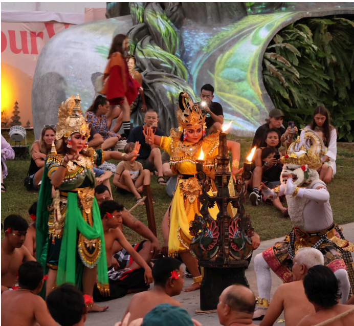
Balinese Kecak Dance at Suara Festival 2024, Nuanu City

Cultural immersion doesn't get much more fascinating than attending a festival, where festival-goers are just as likely to be locals as international tourists. From a rainforest to a UNESCO World Heritage site to artists' studios, you might be surprised that some festivals in Asia and Western Australia are so special that you will happily plan your holiday around these Eight Unique Festivals in Asia and Western Australia .