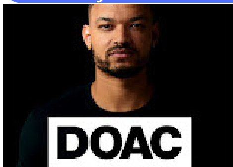
Diary of a CEO